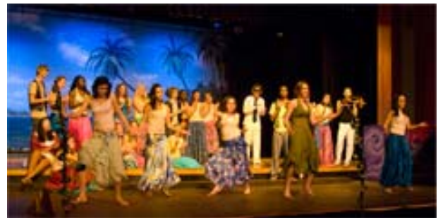
Scene from "Once On This Island"

The silent auction, which raised over $5,000, offered donated items of everything from acting lessons to live pet chinchillas. Boasting wonderfully creative decorations, refreshments, and musical entertainment, the auction will go down as one of the most booming fundraisers the Theatre Department has ever seen.